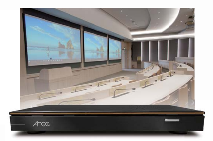
* The third party conference microphone system should support related features.

AREC DS-4CU can be integrated with the compatible third-party conference microphone system and existing audio visual equipment in the meeting room via API command. AREC Speaker Tracking System is simple to set-up, making conference and meeting recording more productive and smart.